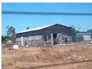
New church building