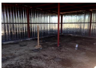
Interior of new youth building