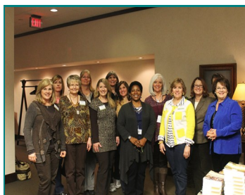
ZMI Ministry Team at the Cove

2014 started off with a bang as our Ministry Team gathered at The Cove, Billy Graham Training Center in Asheville, N.C. for our annual planning retreat.