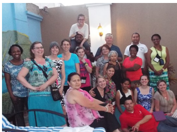
2014 Nicaragua Mission Team

Next on the agenda was our mission trips to Nicaragua and Honduras, and most recently Brazil, where God did a mighty work among the people – both for the people there and for our team.