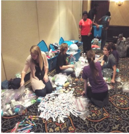
Team assembling over 850 hygiene kits.

"...your body is a temple of the Holy Spirit who is in you..." 1 Corinthians 6:19