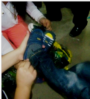
Top: Brand new shoes purchased by YOU! Left: Young girl with her beautiful new shoes Right: A young boy trying on his new shoes